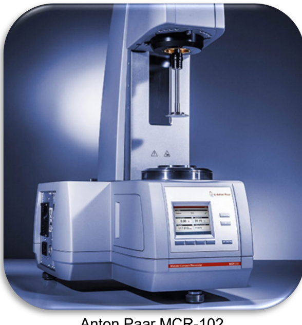
Anton Paar MCR-102

Proppant Transport ○ Rate ○ Viscosity ○ Elasticity